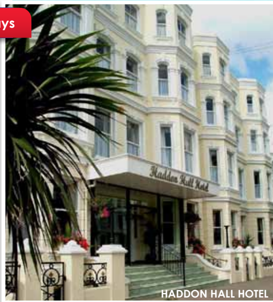
HADDON HALL HOTEL

Centrally situated to make the most of your holiday in Eastbourne, the bandstand is located across the road and the Victorian pier is a short stroll away, the hotel has 75 modern well-furnished centrally heated en-suite bedrooms serviced by a lift, all rooms have colour TV, tea/coffee making facilities and hairdryers, front facing bedrooms enjoy a view across the bandstand to the English Channel.