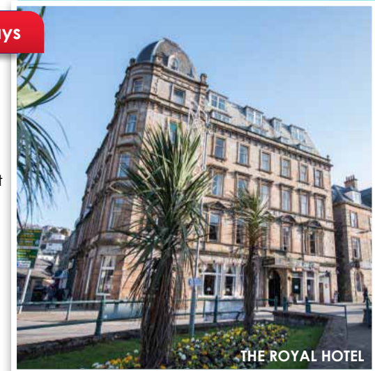
THE ROYAL HOTEL

The Royal Hotel stands in the centre of town close to the harbour and ferry terminal. Our central position makes us ideal for visiting the West Coast of Scotland as well as the Islands of Mull and Iona. Built in 1895 the 3 Star AA awarded hotel offers traditional Scottish hospitality within quality modern surroundings. There is a lift in the hotel and all rooms offer en-suite bathrooms, TV, Telephone, hair dryer and tea/coffee making facilities.