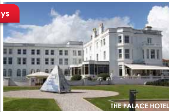
THE PALACE HOTEL

Enjoy a warm welcome at the Palace Hotel, the perfect place for a relaxing Devon holiday. Set in beautiful grounds, The Palace Hotel is situated in a desirable location on Paignton's Esplanade and directly opposite Paignton seafront with Paignton town centre only a short walk away. The Palace offers efficient and professional service and tastefully decorated en suite bedrooms, many with sea views. There is health suite, indoor pool and an entertainment programme running every night of the week all year round.