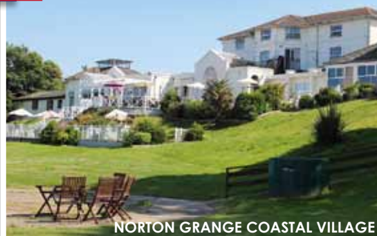
NORTON GRANGE COASTAL VILLAGE

Norton Grange is a chalet village with stunning views of the Solent, it is moments from a maritime museum, underwater Archaeology Centre, a Planetarium and a Model Railway, and the site was even occupied by the Royal Navy during WWII. Fresh seaside chalets built by Warner provide peaceful spaces to relax in after a night enjoying a range of excellent live entertainment, as well as a wide range of daily activities. Norton Grange's restaurant, Castaways, has a broad menu including local and seasonal produce.