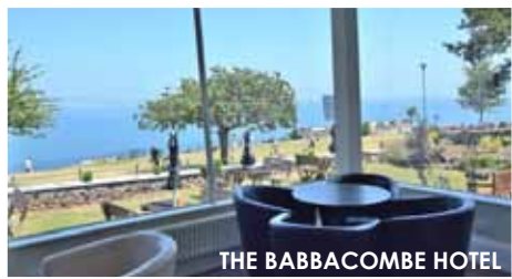
THE BABBACOMBE HOTEL

5 days - price includes 4 nights dinner, bed & breakfast and one full day and one half day excursions.