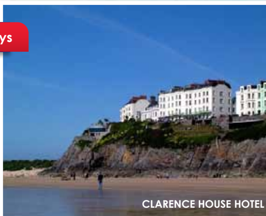
CLARENCE HOUSE HOTEL

Receive a warm welcome to Clarence House Hotel from the friendly receptionists. The hotel is located on the Esplanade in Tenby, overlooking the beautiful South Beach. Rooms have a flat-screen TV, tea and coffee making facilities and a writing desk, perfect for reading or just taking in the surrounding views of the garden or town.