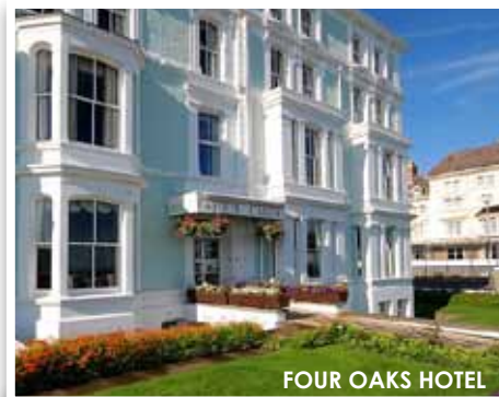
FOUR OAKS HOTEL

The very popular Four Oaks Hotel is situated right in the heart of Llandudno on its panoramic promenade, offering a warm welcome to all Guests with nothing being too much trouble. You can be sure of Good Food, Comfort and Courtesy at The Four Oaks Hotel. Disabled access to the hotel is helped by the fact that entry to the hotel is level from the promenade with no steps at the front door and you will find a lift to all floors once you enter the hotel.