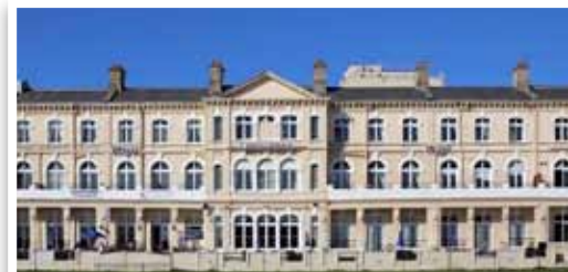
ROYAL GROSVENOR HOTEL

Situated within a minute walk to the sea the The Royal Grosvenor offers views overlooking the lawns, seafront and the Grand Pier. Enjoy a drink in the good-sized bar or take in the views from the comfortable lounge area. All rooms are with en-suite bathrooms and central heating, flatscreen TV, tea/coffee making facilities, hair dryer and WIFI, there is a lift to all floors.