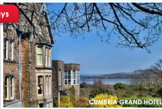
CUMBRIA GRAND HOTEL

The Empress Hotel aims to make your stay a pleasurable experience. With central location to most of the Islands attractions, the local shops, restaurants and bars are a 5-10 minute walk away. The Hotel as a lift to all floors and all rooms have TV, Tea/Coffee making facilities and Wi-Fi. Please note there are no walk-in showers available at this hotel.